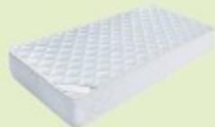
Box Springs & Mattresses