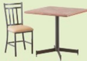
Dining Tables & Chairs