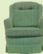
Chairs & Sofas