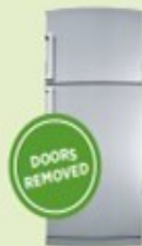
Refrigerators & Freezers